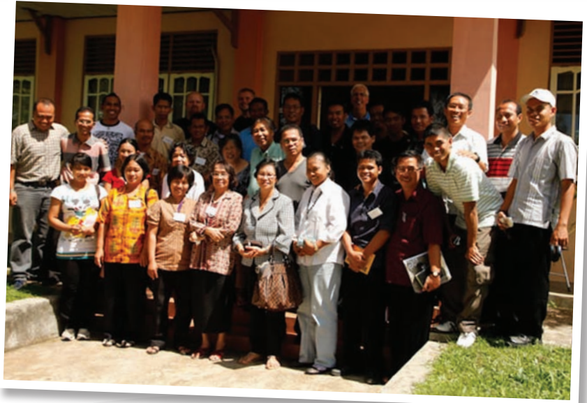
God is doing amazing work through his servants at MSI sites around the world! Many were encouraged and inspired at the recent MSI Southeast Asia Mission Site Leader Retreat.